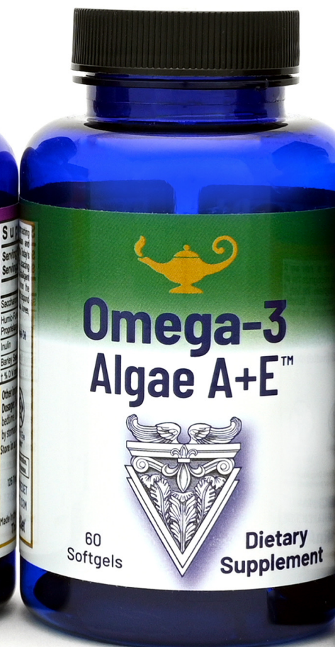
Vegan Omega 3 + Vitamin A+E