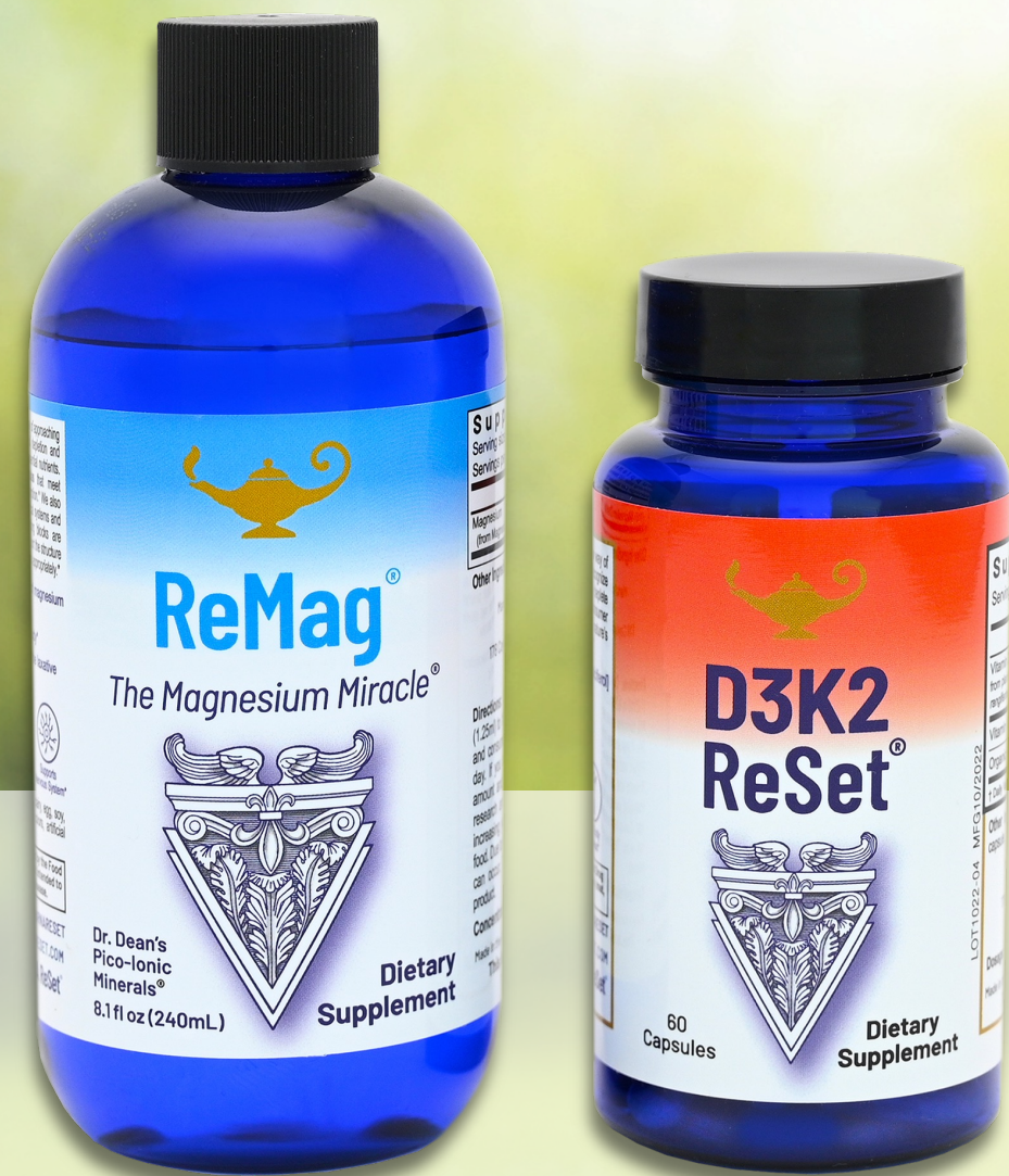
Magnesium & Vitamin D3K2 Bundle

Working with the Building Blocks to Encourage Optimal Health