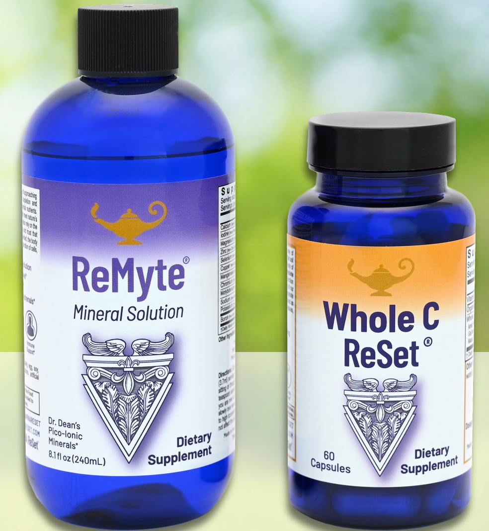
Thyroid & Adrenal Support