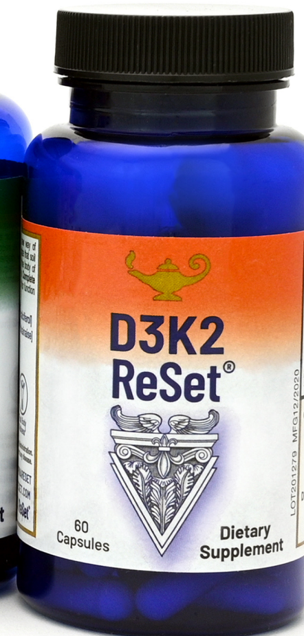
Vegan sourced Vitamin D