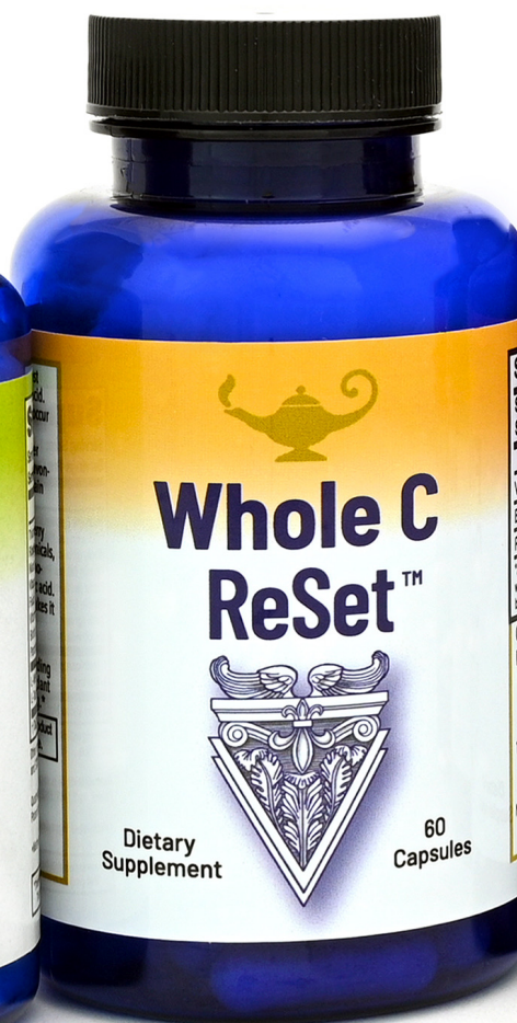
Full Spectrum Vitamin C