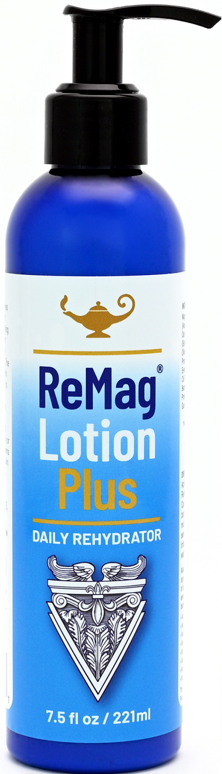
Mg Infused Lotion + Balm

Light and enjoyable Infused with nutrients Support for mineral intake beyond oral applications