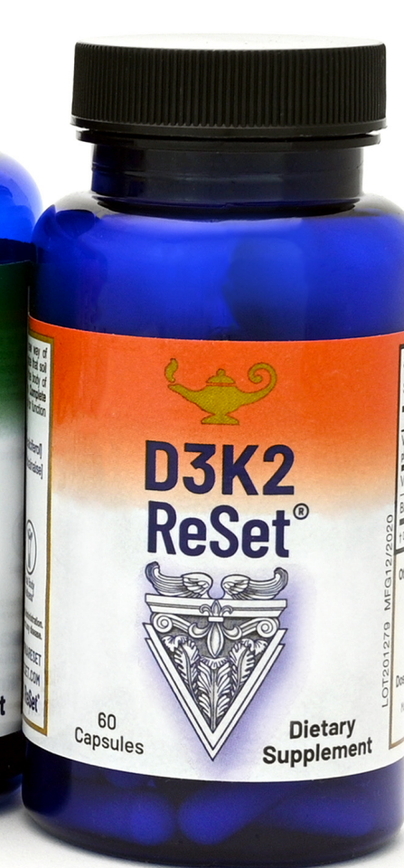
Vegan sourced Vitamin D