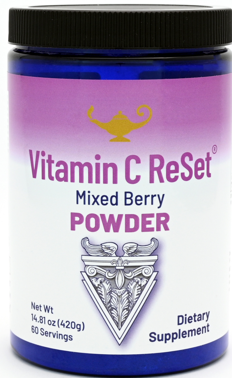
Vitamin C Powder